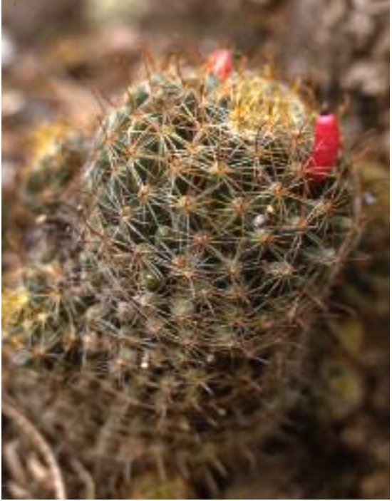
M. sempervivi, and M. crinita ssp. wildii enjoying the high life as arboreal epiphytes above the Río Metztitlán.