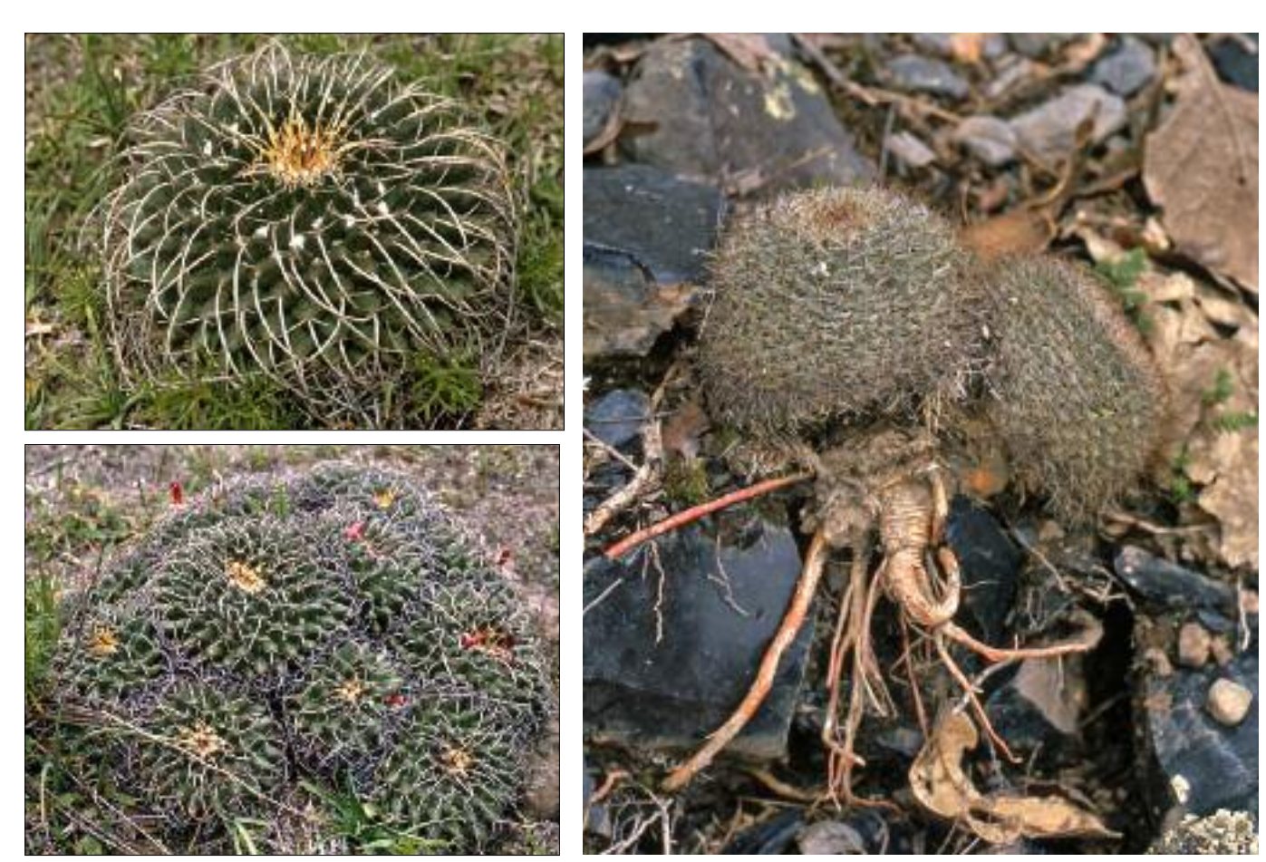
Above ( left ), more variants of M. magnimamma in the previous locality, and ( righ t) M. wiesingeri in its type locality, rooted between loose blocks of obsidian. Below, Cephalocereus senilis , threatened by road-building and erosion.